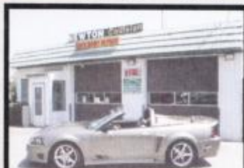
Newton Collision Repair • 631-273-0983

Show the direction of the vehicles involved in the accident and the point of collision. Show street names, location of street signs, etc.